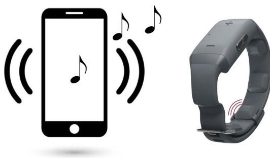
Figure 1: Bimodal stimulation. Tones are played from a phone app; a haptic wristband vibrates simultaneously with each tone. The location of the vibration is a function of the frequency of each individual tone, such that the frequency map is spread across the skin. Participants in the control condition listened to tones from the phone app but did not receive a wristband and were given no haptic stimulation.

The weekly progression of participant scores can be seen for all participants in Figure 3. Among all participants in the experimental group, 91% showed improvements (i.e. TFI moved in the negative direction), and 64% of those